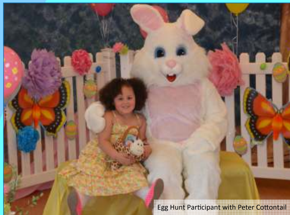
Egg Hunt Participant with Peter Cottontail

Come test your vocabulary skills and join us for the 4 th Annual Unalaska Public Library Scrabble Tournament.