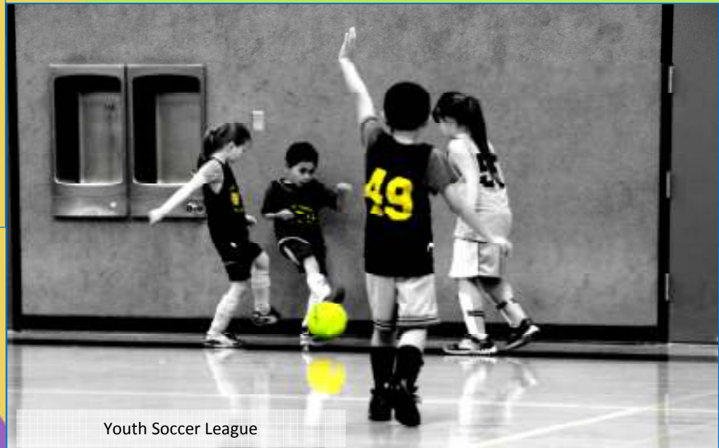
Youth Soccer League