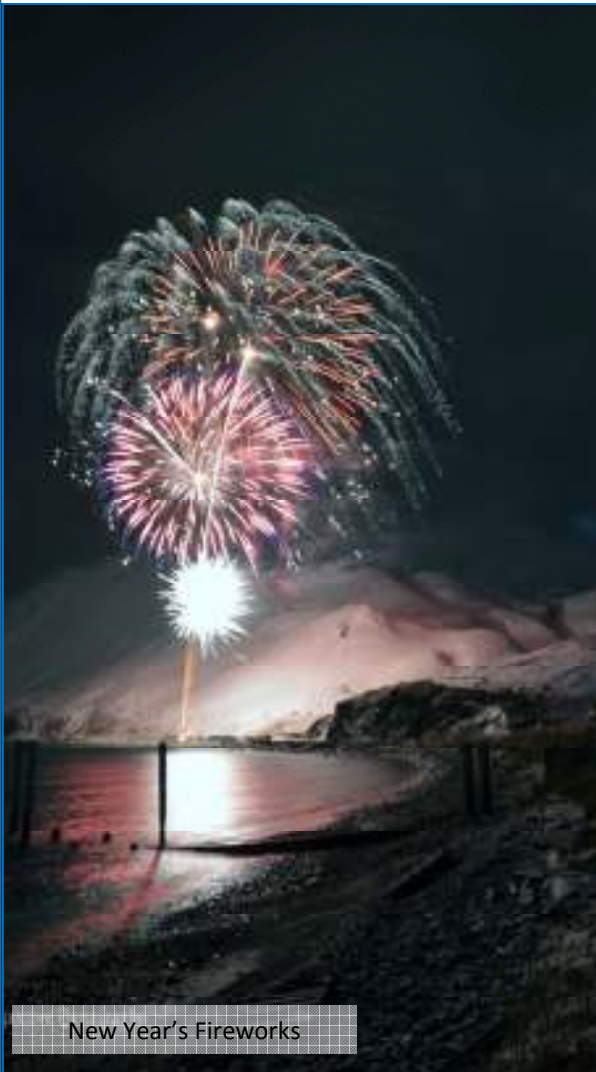
New Year's Fireworks

Saturday & Sunday 12:00 noon - 6:00 p.m.