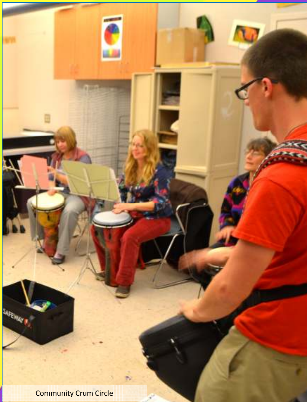
Community Crum Circle

It's a Party! Join the Library staff to celebrate Dr. Seuss's 110 th Birthday.