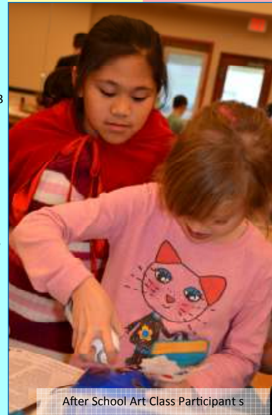
After School Art Class Participants