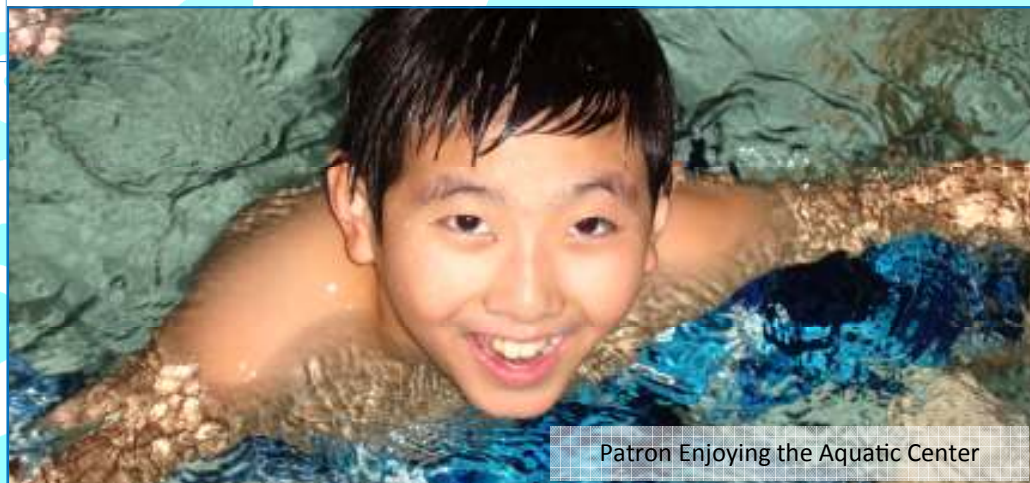
Patron Enjoying the Aquatic Center