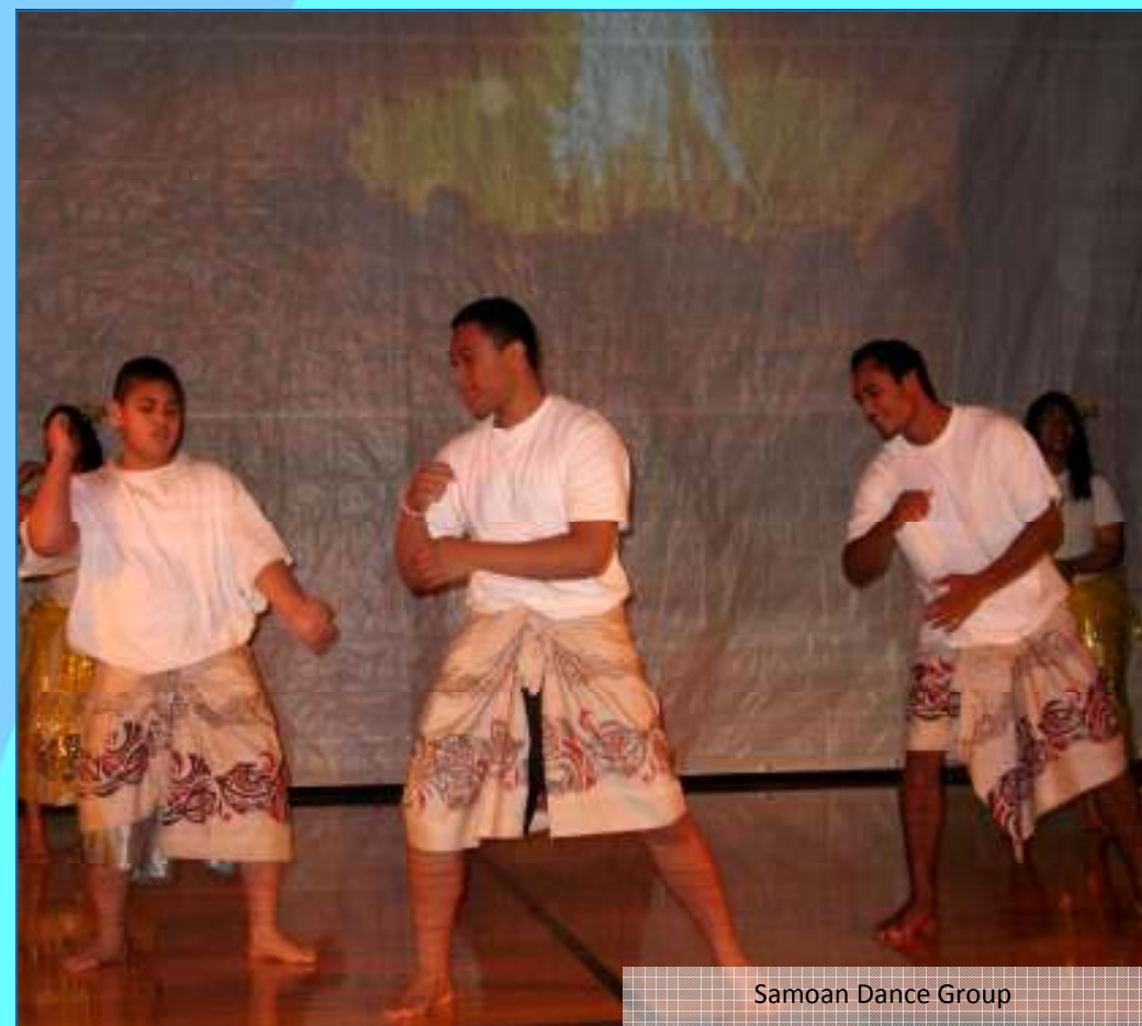
Samoan Dance Group

Stop by the library to guess how many hearts are in the jar! Winners will be announced on Valentines Day!