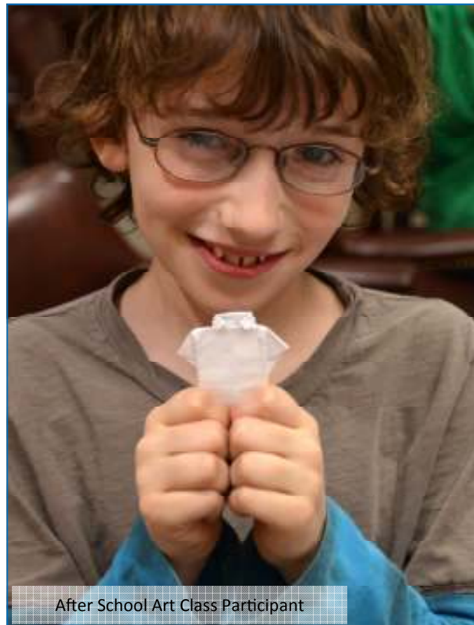
After School Art Class Participant