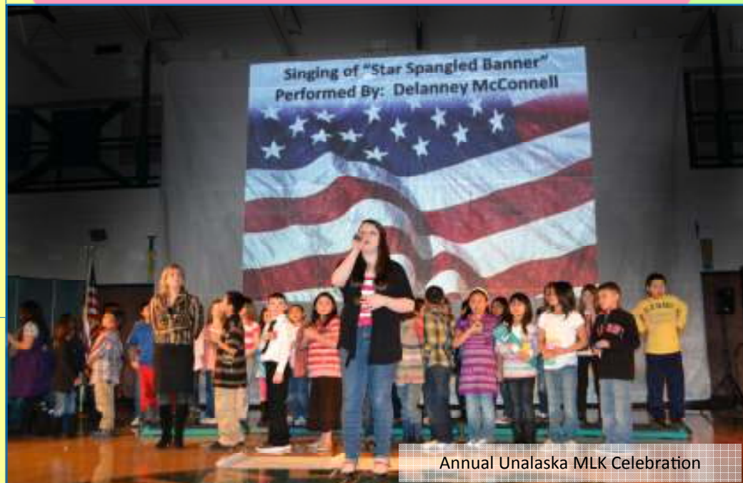
Annual Unalaska MLK Celebration

No Fee: Clean up bags available at select community locations and all PCR facilities.