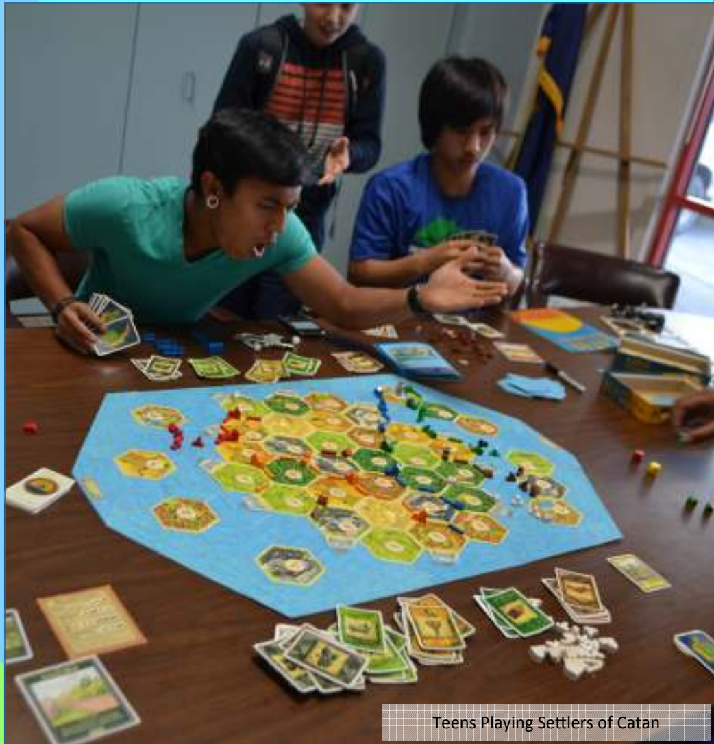
Teens Playing Settlers of Catan

*Look for more information on the upcoming Midnight Madness and additional Teen Programming from Teen Council.