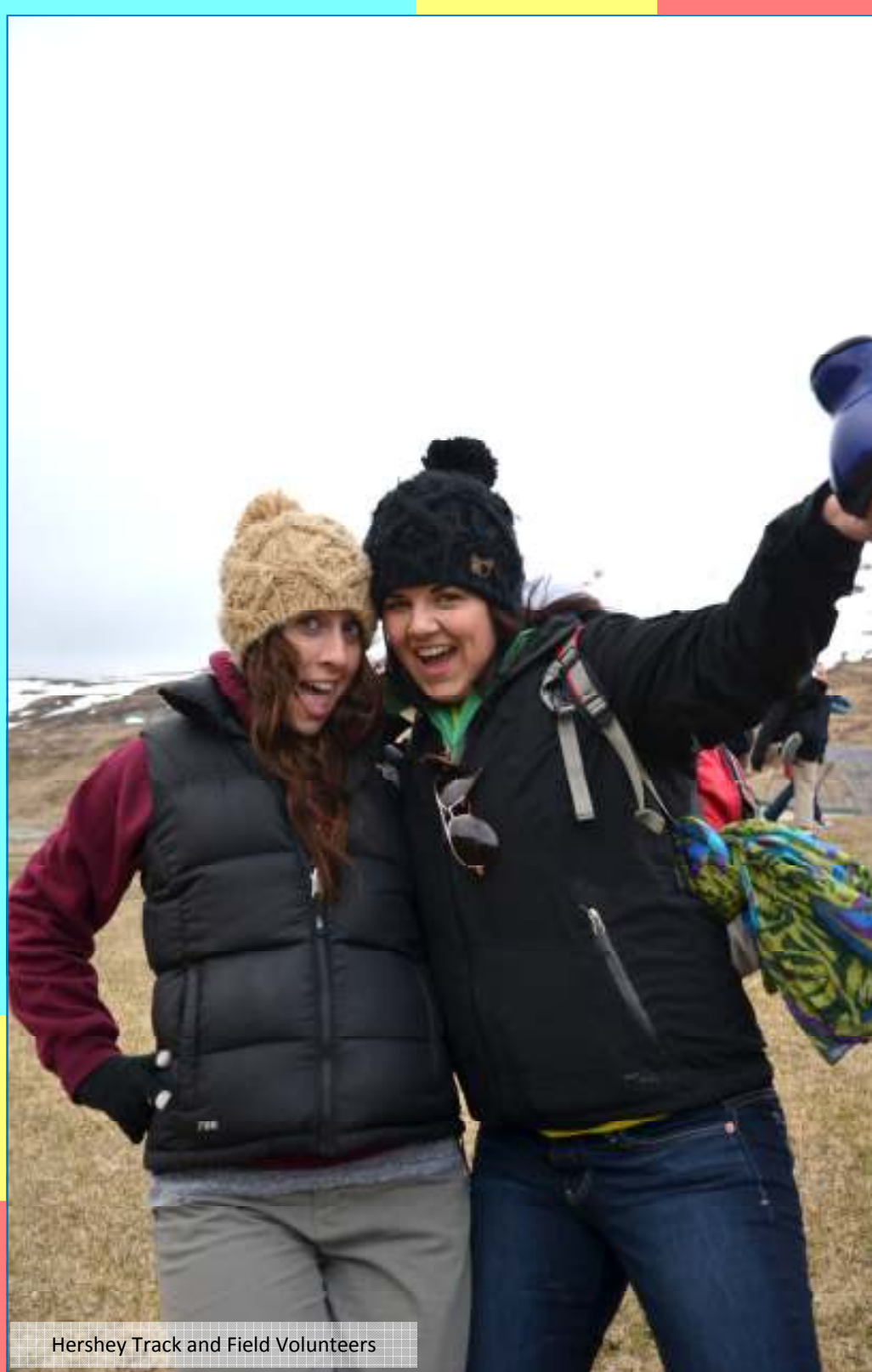
Hershey Track and Field Volunteers

Stop by the library to guess how many hearts are in the jar!