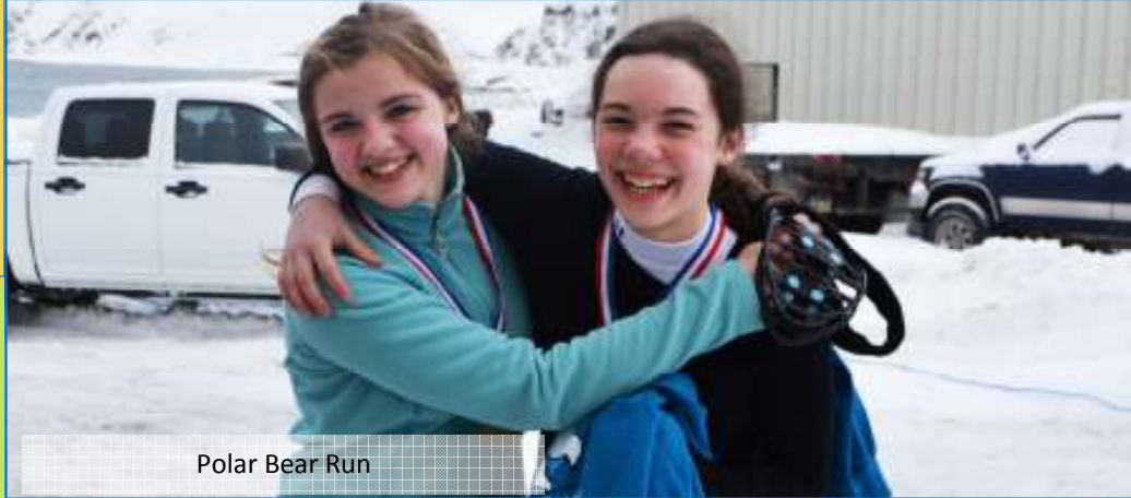
Polar Bear Run